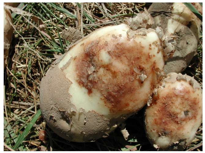
Figure 5. Peeled potatoes with red to tan firm lesions on the internal surface.

The spores produced on the leaves are easily disseminated by splashing rain or irrigation water, which subsequently infects the tubers and leaves of neighboring susceptible plants. Wind can carry the spores longer distances, to commercial fields of potatoes up to several miles away.