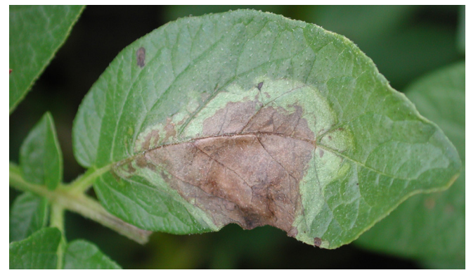
Figure 1. Late-blight lesions on potato leaves are characteristically bordered by a light-green margin.

to know that late blight, due to rapid reproduction and wind dispersion, can spread from a garden to potato fields hundreds of miles away. Fortunately, the normally hot, dry conditions of southern Idaho are not conducive to late blight. Nevertheless, disease outbreaks occur every few years and home potato and tomato growers should be aware of late blight.