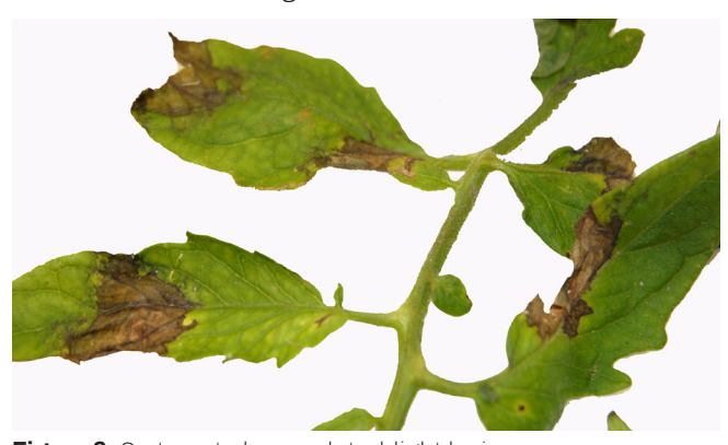
Figure 2. On tomato leaves, late-blight lesions appear irregularly shaped and water-soaked in appearance.

In commercial potato fields in southern Idaho, late blight typically occurs later in the growing season, from July onwards, with symptoms often appearing after plants have reached row closure. However, the disease can appear at any time in a home garden. Tell-tale symptoms of late blight on potato or tomato are circular to irregularly shaped brownish-black, water-soaked lesions on the leaves. These lesions usually are bordered by a light-green margin (Figures 1 and 2). Petioles and stems can also be infected and develop similar lesions (Figure 3). The entire potato and tomato plant will eventually become infected and die from late blight.