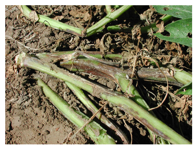
Figure 3. Late-blight infections on potato stems.

Tomato fruit can also be infected, with symptoms appearing as diffuse, dark brown, mottled patches that are firm, not soft with white mold growth as the signs of the disease (Figure 4). Lesions on the surface of affected potato tubers may be sunken, brown, or purplish in color. Underneath, dry, firm lesions that are reddish or tannish brown in color and extend slightly inward may develop. These lesions are best observed by lightly peeling the skin over the affected areas of a tuber (Figure 5). Symptoms of late blight can further develop in storage; affected tubers can be more susceptible to secondary infection by soft rot organisms that decay tubers more quickly.